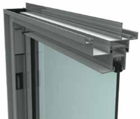
Easy take out clips on side jambs for removal of sash and integrated lever handle in sash.